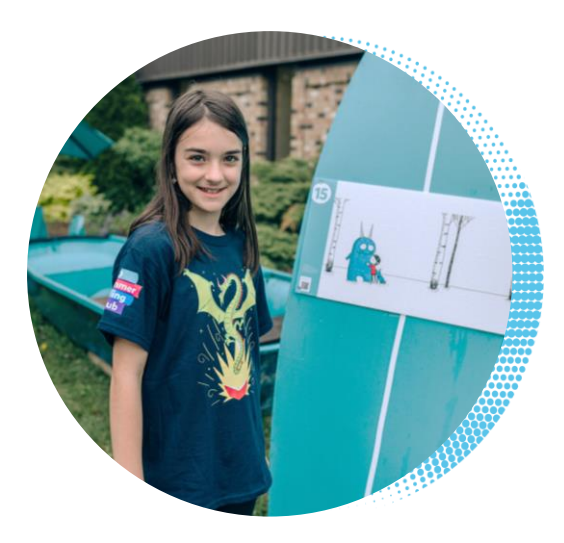
A Francophone launch event was held at Bibliothèque Municipale Émile-Nelligan in June 2022

Since 2007, the TD Summer Reading Club Library Awards have recognized and rewarded the most innovative and effective TDSRC programs at local libraries across Canada thanks to TD Bank's support. The 2021 Library Awards were presented in person at the Rendez-vous des bibliothèques publiques du Québec in Montreal in May and virtually at the Atlantic Provinces Library Association conference in June 2022. The awards include cash prizes for dedicated libraries to support quality programming across the country. Penhold & District Library took first place for their creative Mobile Summer Reading program.