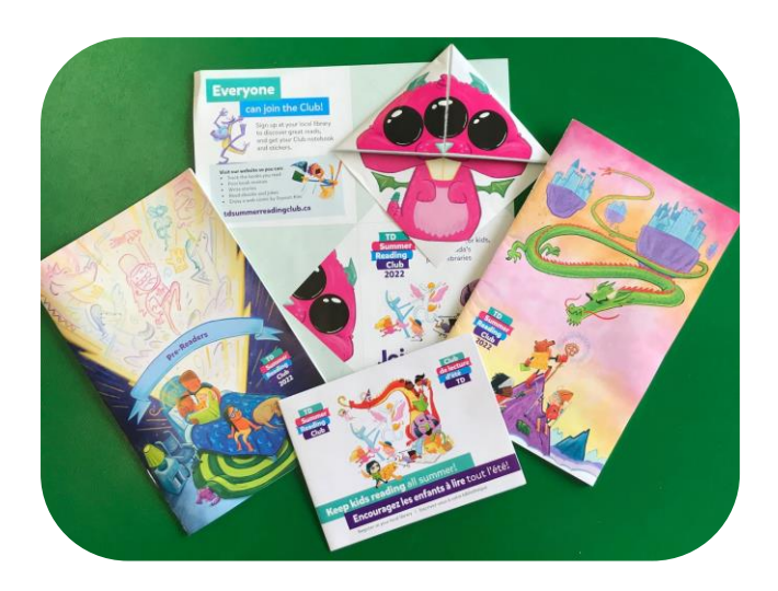
This year we distributed over 2 million print materials, including an origami promotional bookmark for kids.